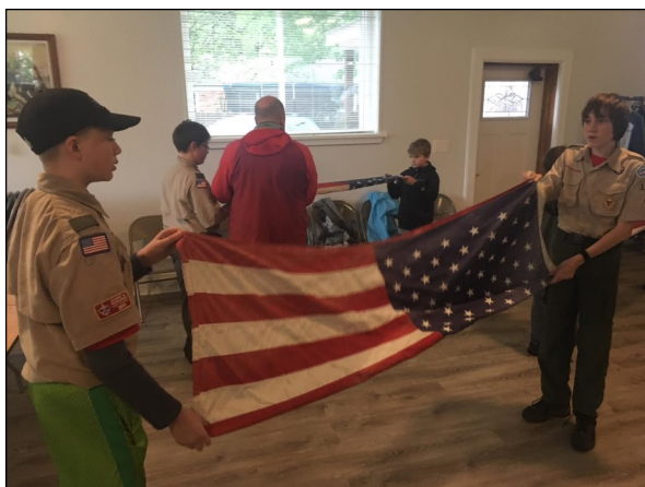
Scouts from Troop 1159 Honor the Flag with Proper Folding

Participants were given a brief history of the flag, as well as instruction on how to properly fold the flag. In addition, pamphlets and reading material about the flag were provided