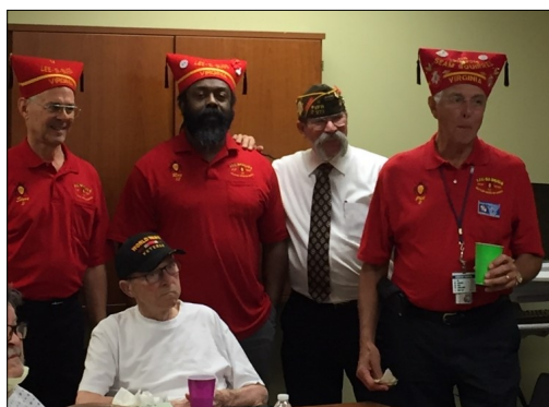
Cooties and Comrades at the Dulles Health and Rehab Center in Herndon